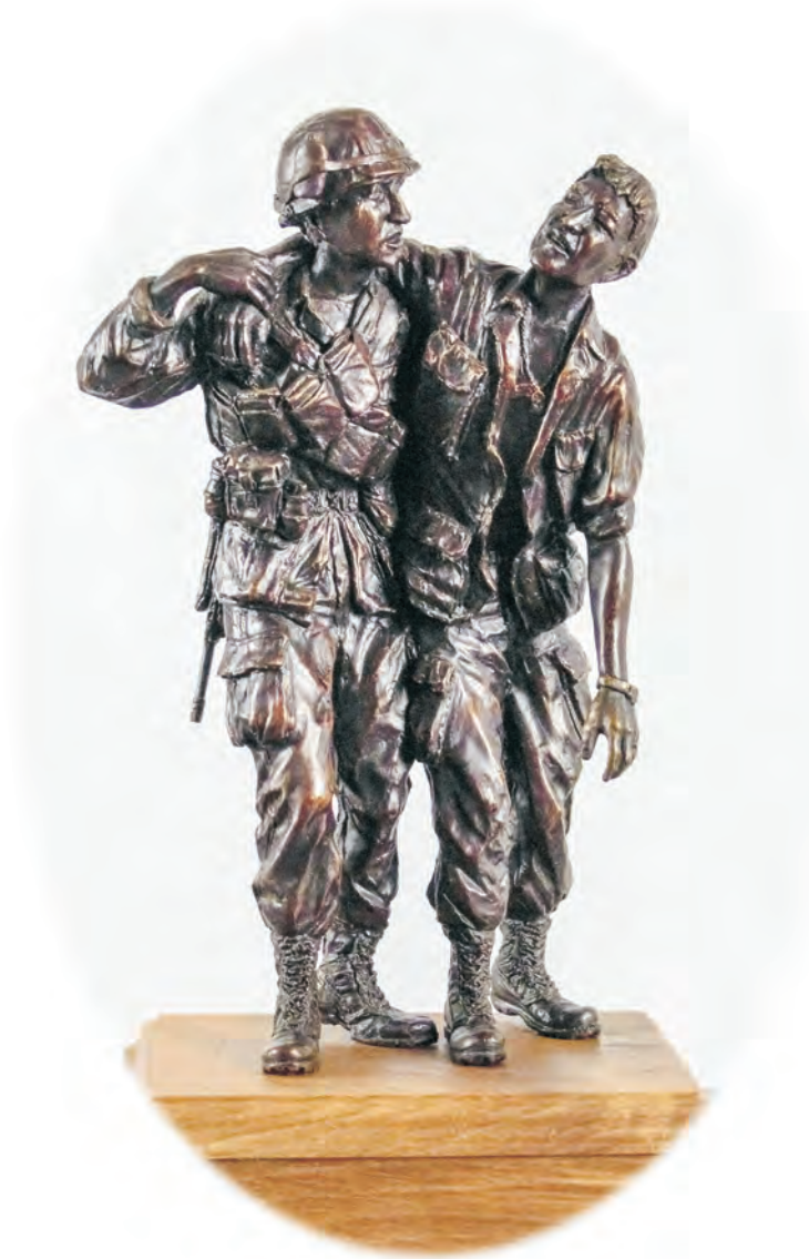
196TH LIGHT INFANTRY BRIGADE MEMORIAL MONUMENT WALK OF HONOR - NATIONAL INFANTRY MUSEUM - FT BENNING, GEORGIA