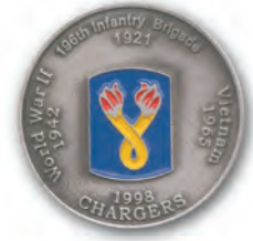
196th CHALLENGE COIN